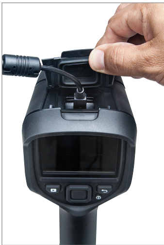
Download images fast via USB

Specifications are subject to change without notice. For the most up-to-date specifications, go to www.flir.com