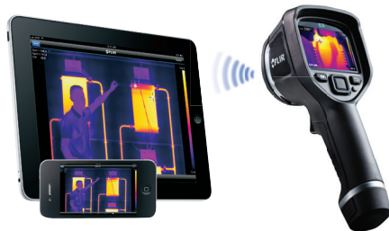
Wireless Connectivity to Smartphones, Tablets and more.

PORTLAND Corporate Headquarters FLIR Systems, Inc. 27700 SW Parkway Ave. Wilsonville, OR 97070 PH: +1 866.477.3687